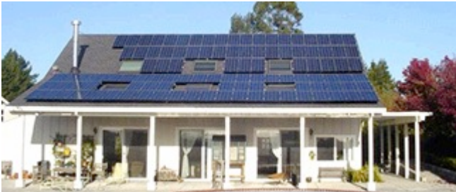
Two examples of roof arrays designs which detract from the integration with the roof.