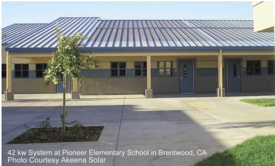
42 kw System at Pioneer Elementary School in Brentwood, CA