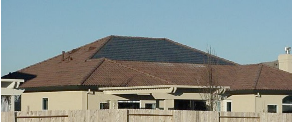
Solar shingles.