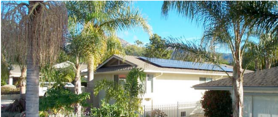
Well planned array.