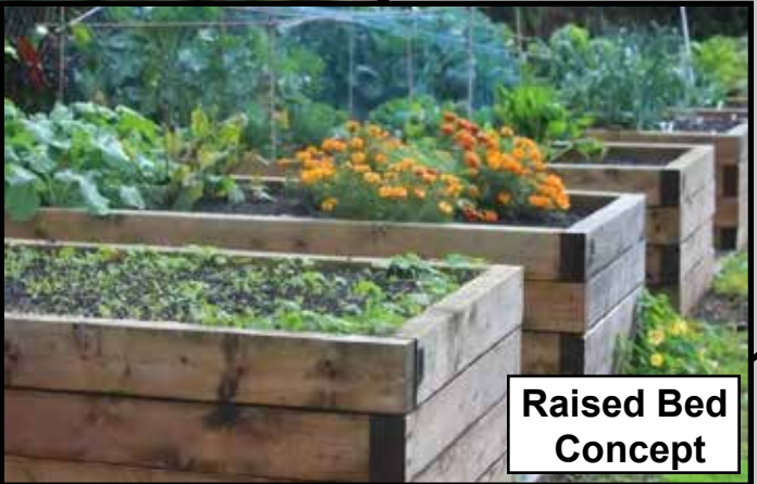
Raised Bed Concept