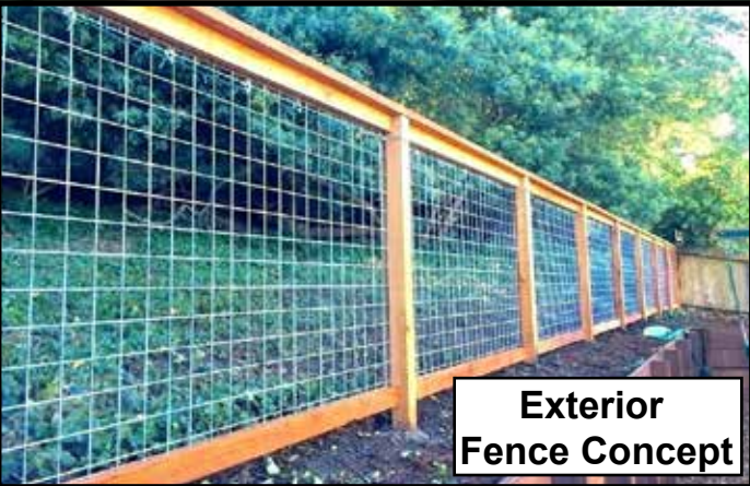
Exterior Fence Concept