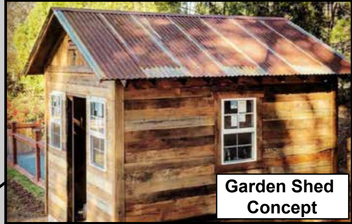
Garden Shed Concept