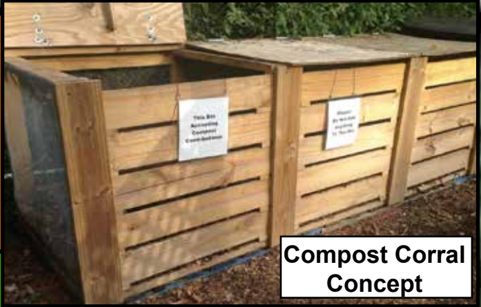
Compost Corral Concept