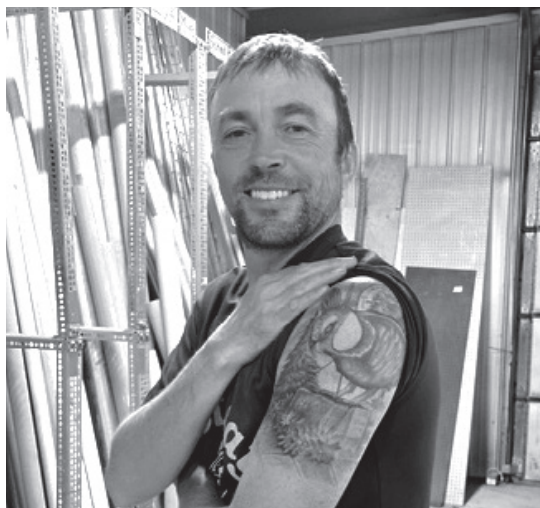
Prairie chicken commitment