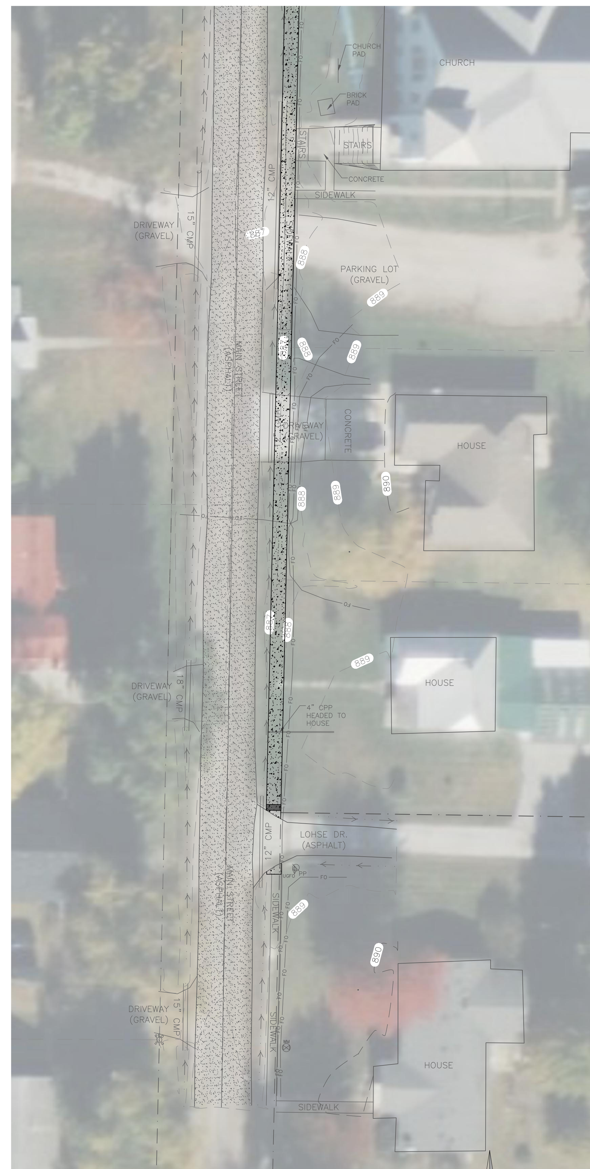
2 SITE LAYOUT D C1.2 SCALE: 1" = 20'