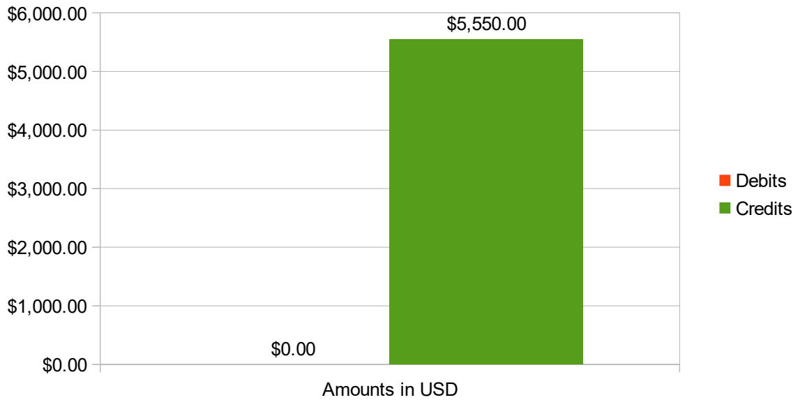
July 2017 Fire Dept. Debits & Credits Chart