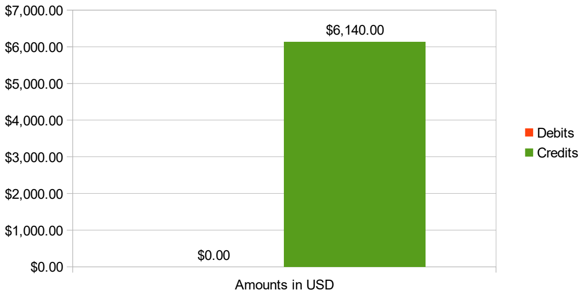
April 2017 Fire Dept. Debits & Credits Chart