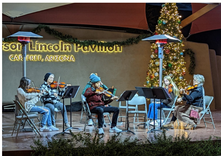
Photo: Jubilate Conservatory of Music braves the cold to perform in Sanderson Lincoln Pavilion

10 Quirkiest Streetnames in the US | The Travel