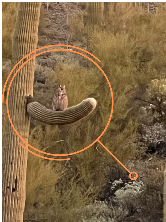
One of the locals enjoying a Carefree morning