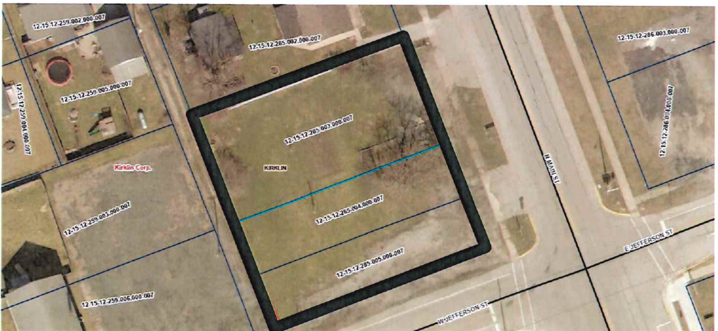
Entire area is outlined

Change on the Town of Kirklin Zoning Maps from the R-3, Medium Density Residential, Zoning District to the B-2, Central Business, Zoning District over the entirety of Lots 67 and 68 of Block 12 in the Town of Kirklin, Indiana as indicated on the following map: