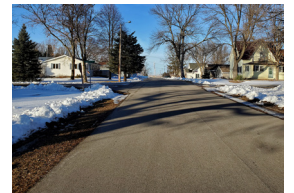
A street in Blairsburg

In 2020, Blairsburg received $20,358.00. Funds have been used for street repairs. Future funds would be used for infrastructure improvements and any lawful purposes for the community.