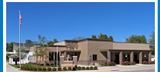
Stanhope Community Center

100% of the proceeds of Local Option Sales & Service Tax have been used to retire debt of the Library and Community Center. Future proceeds will be used to further retire debt on the Library and Community center and infrastructure needs of the City including but not limited to Roads and Parks.