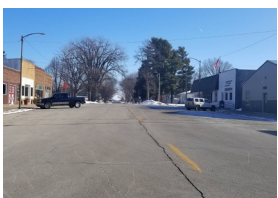
Randall Main Street