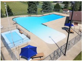
Stratford Municipal Pool