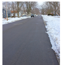
1200 Block of Water Street

For more information please visit the city's website at: www.webstercity.com .