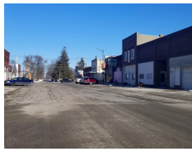
DeWitt Street Ellsworth