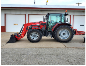
Williams City tractor

Its renewal will be on a ballot March 2, 2021.