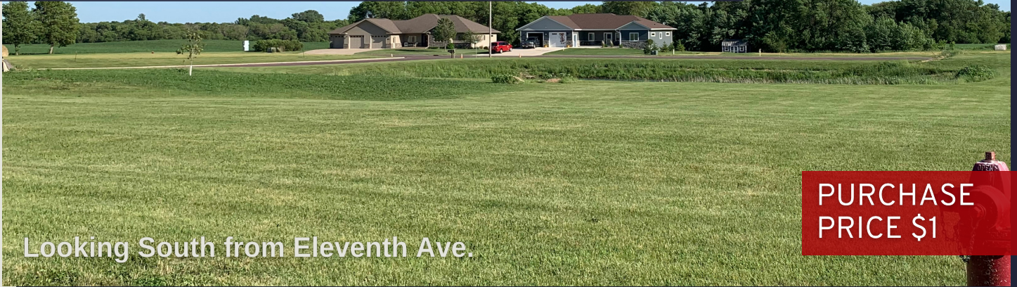
Looking South from Eleventh Ave.