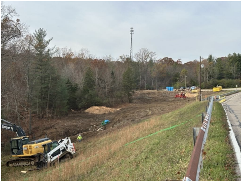
Clearing the downslope area

Please follow https://cscd-in.org/cordry-spillway-replacement-project for updates and pictures.