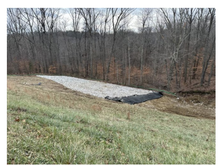
Rip-rap installed east of the spillway 3