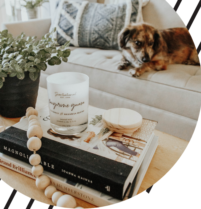
1 BED | 1 BATH SQ. FT.